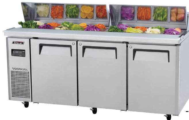
- Pans included.